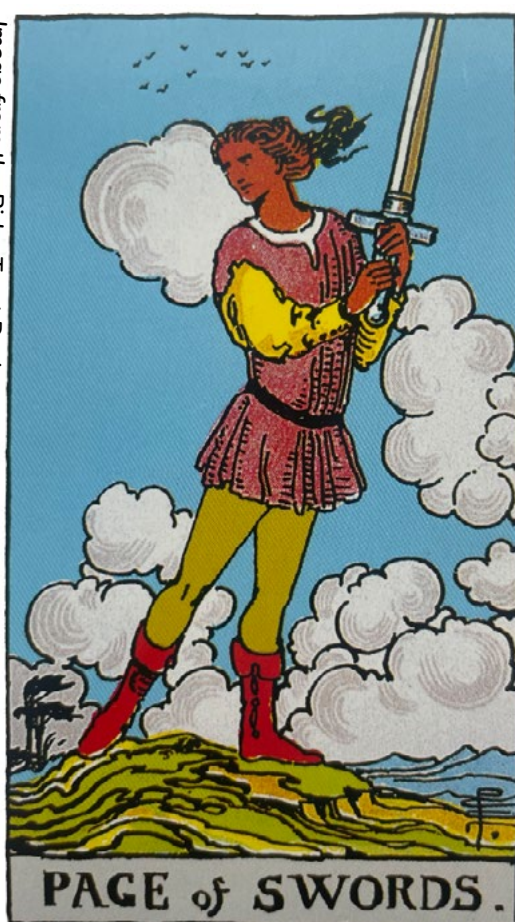
Image from the Rider Tarot Deck

Swords cards represent things to do with stress or authority. Page of Swords represents authority, secret service, vigilance, spying, examination and the qualities related thus to. Reversed; this card represents the darker or more evil side of these listed qualities. Often what is unforeseen or unprepared for....sickness can also be suggested.